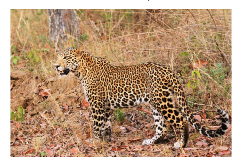
Leopard in Satpura National Park