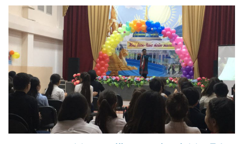
ICC Participates in the Celebration "Armysyn, Az-Nauryz!" at School No.54